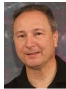
West Springfield, Massachusetts