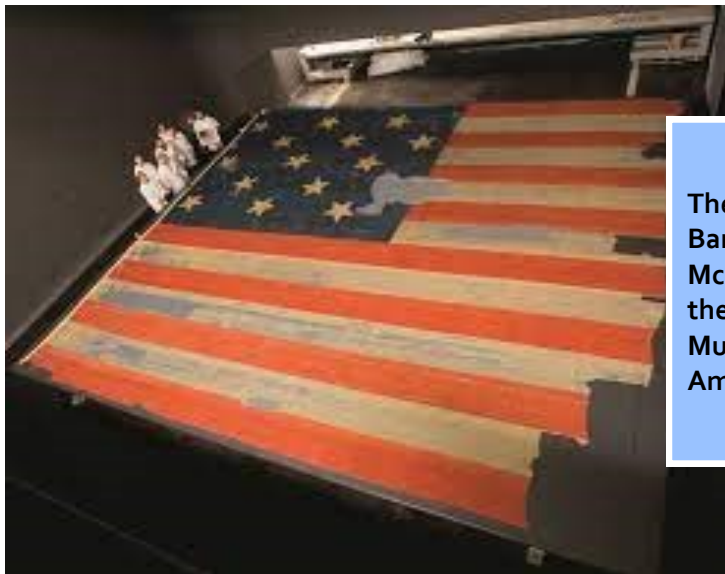
The Star Spangled Banner from Fort Mchenry housed at the National Museum of American History

They continue to improve their teaching and dancing skills and are honored and pleased to join in the celebration at The 2022 Star Spangled Banner Festival.