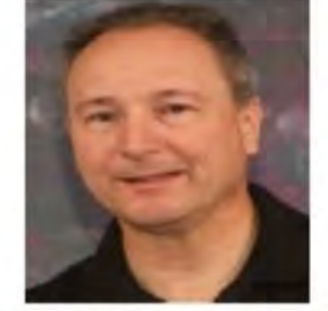
West Springfield, Massachusetts